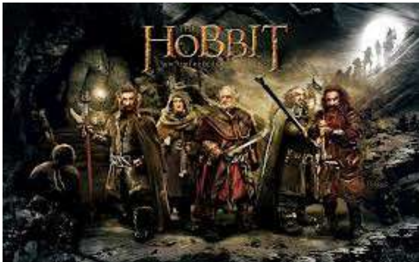
Theatrical Poster