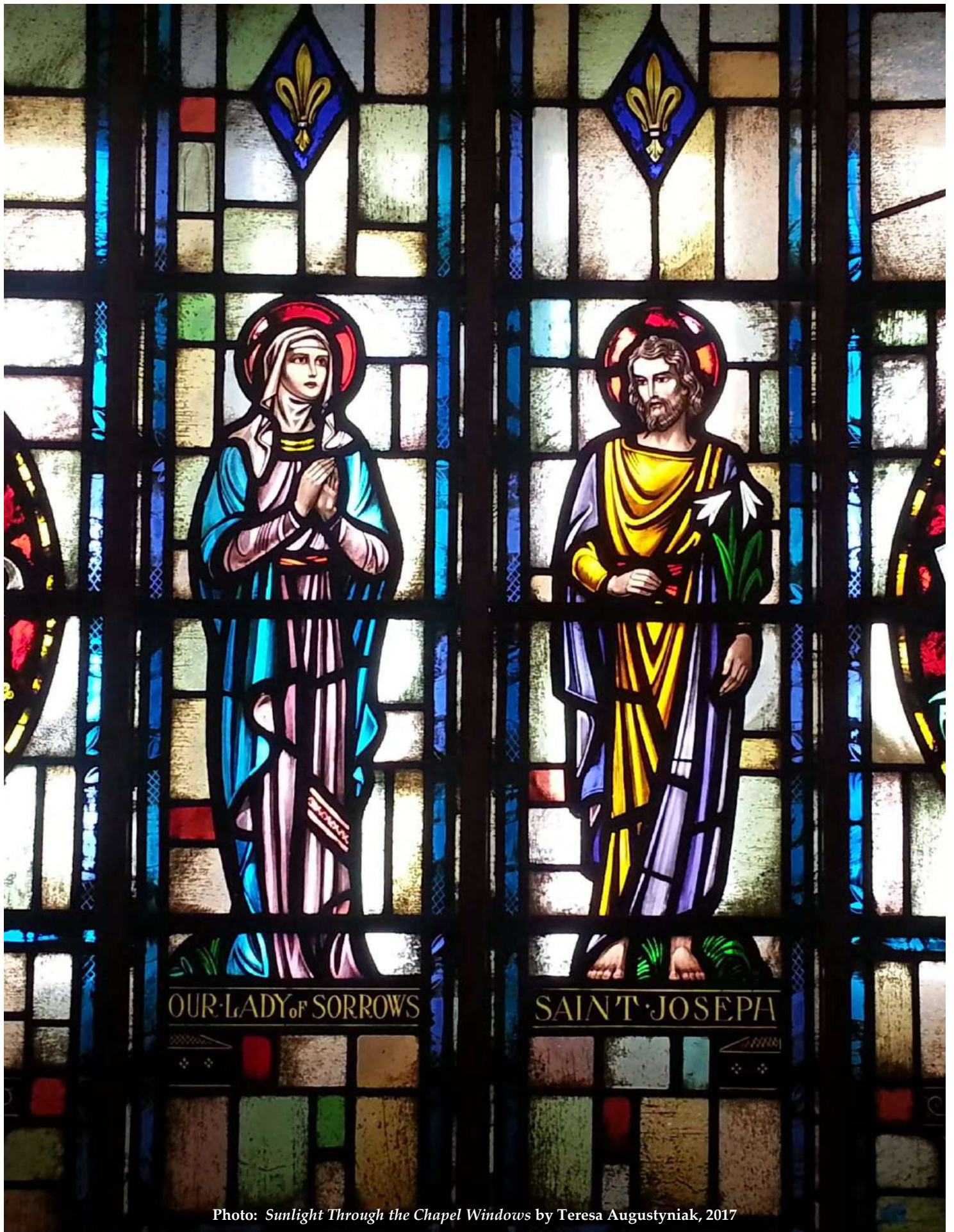
Photo: Sunlight Through the Chapel Windows by Teresa Augustyniak, 2017