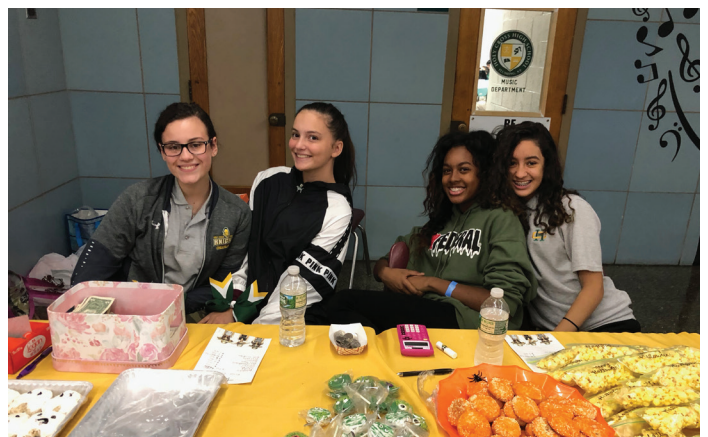
Thank you to City Waste for donating $150.00 of Dunkin Donuts to help our Cheerleaders raise money for their team!