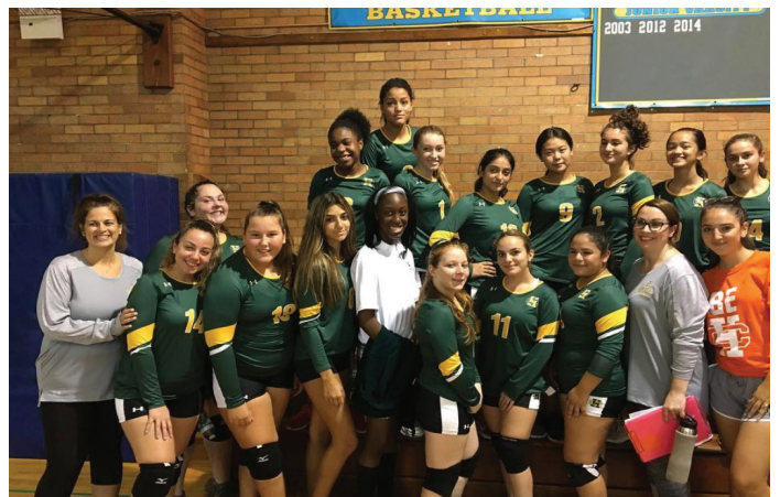
Our first HC Women's Volleyball Match!